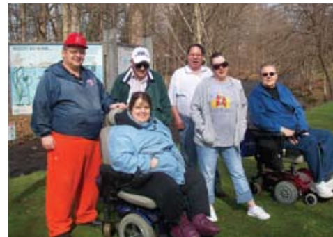
Trip to Carpenter's Brook Fish Hatchery

Daybreak strives to provide participants with educational, entertaining and even inspiring day trips throughout the Central New York community, as well as meaningful therapeutic group projects that benefit other non-profit organizations. Here are a few highlights: