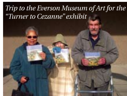
Trip to the Everson Museum of Art for the "Turner to Cezanne" exhibit