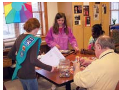
Girl Scouts join in craft project with participants.