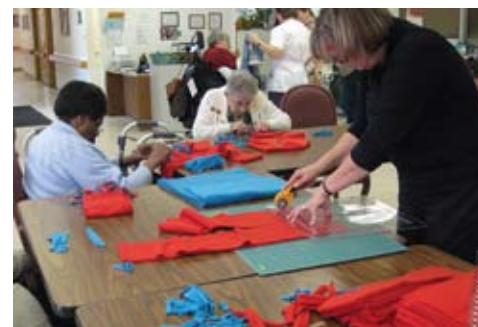
Participants made 100 scarves to donate to the Special Olympics.